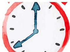
Board & Club Meeting Minutes