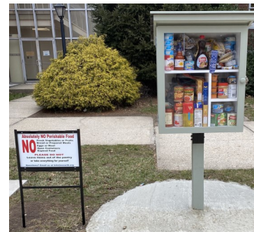
Little Food Pantry

The laundry detergent, diapers and baby food were all delivered to the Human Needs Food Pantry in Montclair, and the pet food went to Bloomfield Animal Shelter .